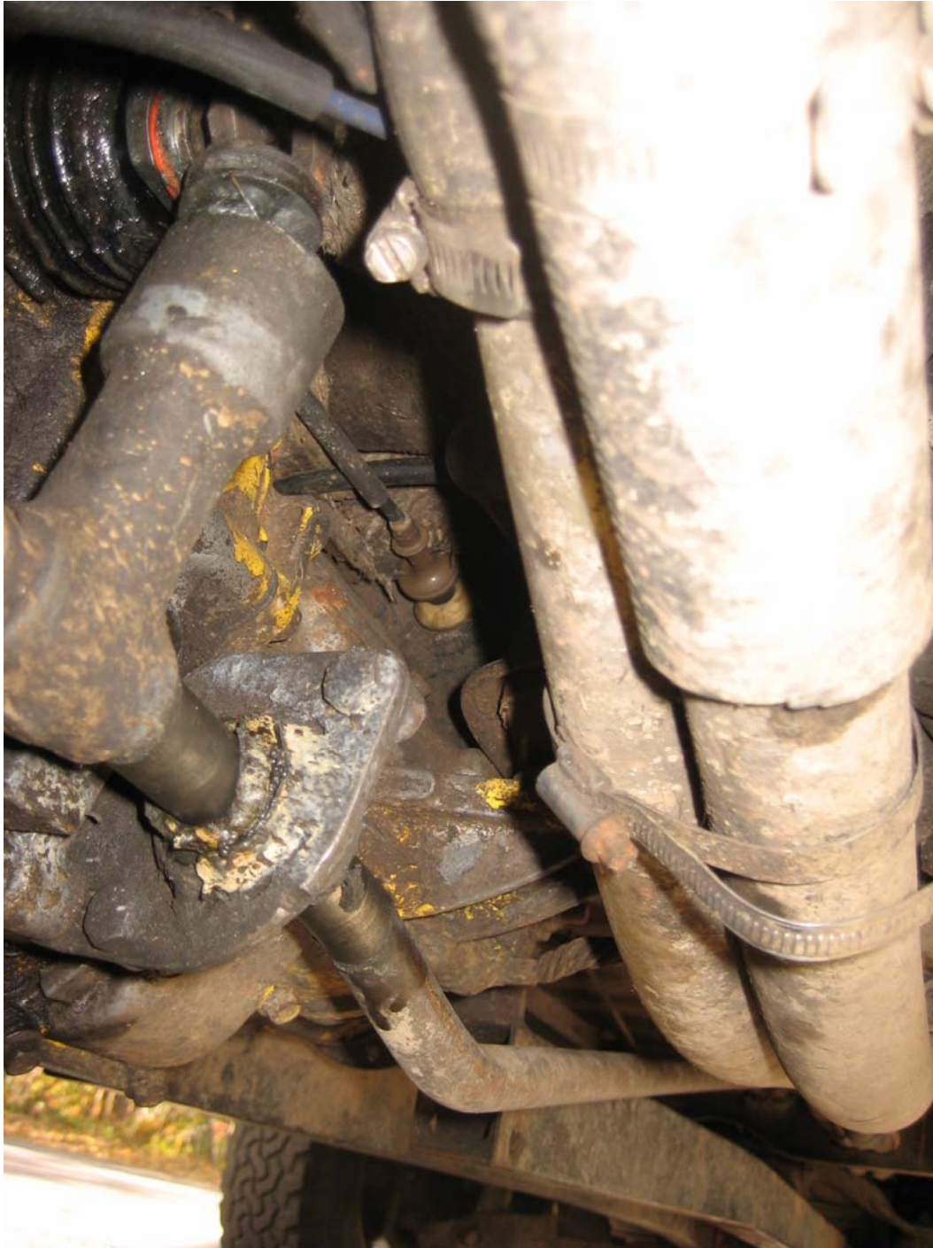
This picture shows the throttle cable entering the first cross member from the rear, using the same hole as the original throttle cable did. Note how the white squishy retainer is used against the crossmember.